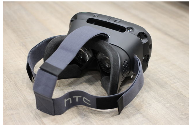
HTC Vive VR Headset