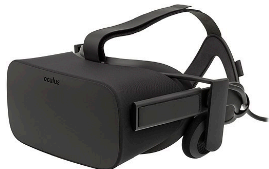
Oculus Rift VR Headset